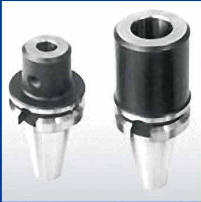
SIDE LOCK Holder