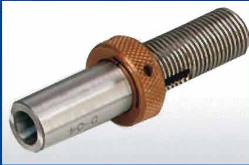
Quick Change Adapter