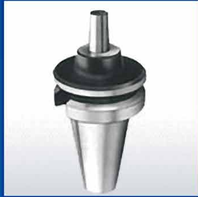
Drill Chuck Holder