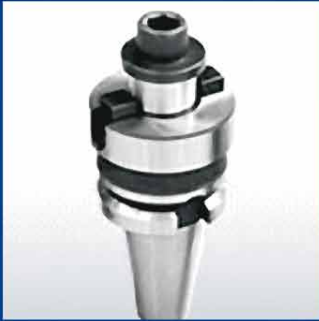
Face Mill Arbor