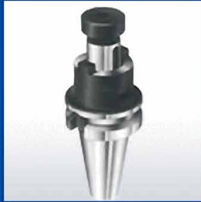
Side & Face Cutter Arbor