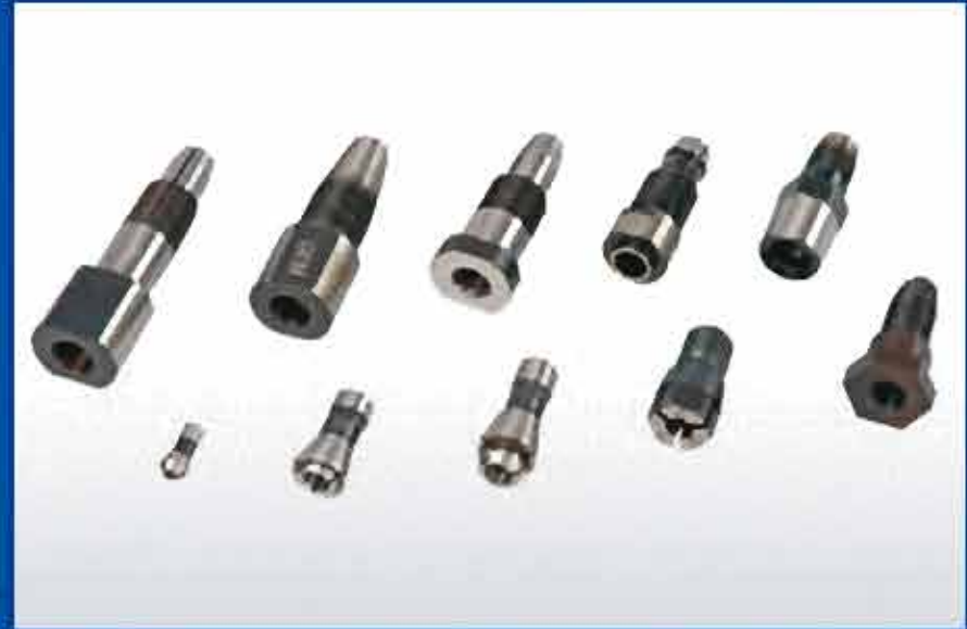
Die Grinding Collets