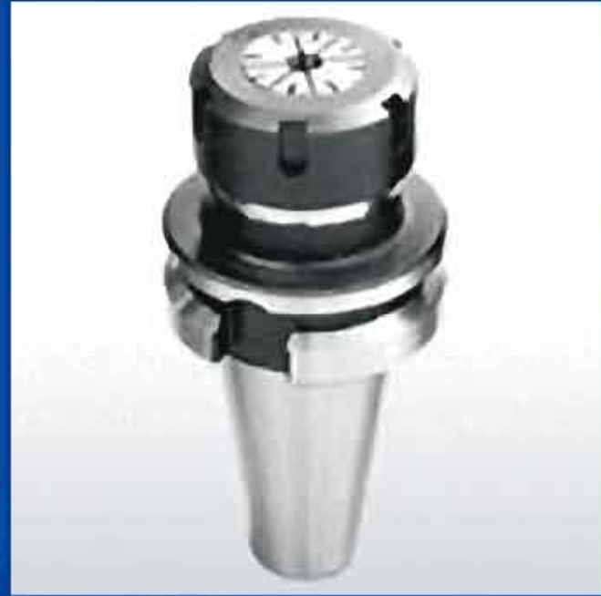
Collet Chuck Holder