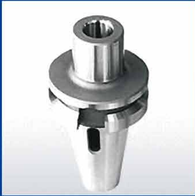
Morse Taper Holder